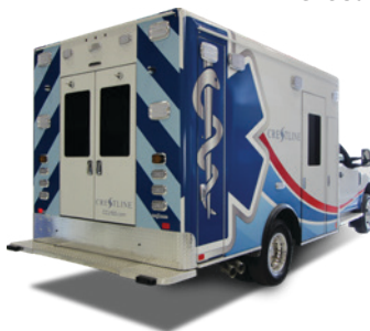
The all aluminum underbody bumper protects the module in low impact collisions.