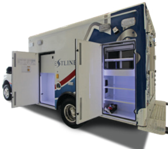
The CCL 150 offers 51.9 cu. ft. of exterior storage space.