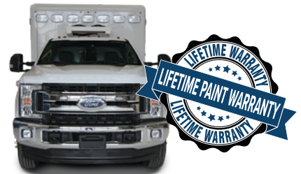
CrestCoat is a durable and cost effective corrosion prevention solution backed by a Lifetime Paint Warranty.

Worry-free maintenance with readily available parts.