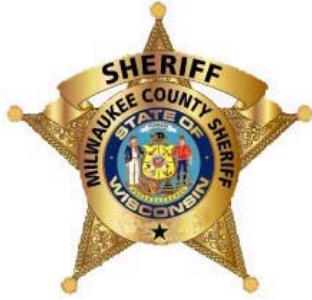
David A. Clarke, Jr., Sheriff Milwaukee County Sheriff's Office